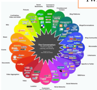
social media tools diagram